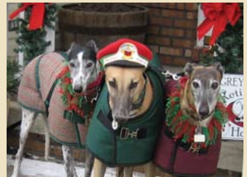
Contest Winners and Runners-Up, pgs 7-8

PHOTO CONTEST . . . . . PGS 7-8 Holiday Photos!