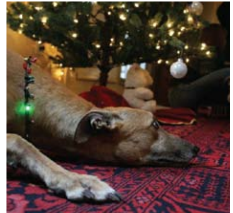
Runner Up: Mimosa