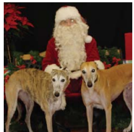
Runner Up: Chase and Cookie