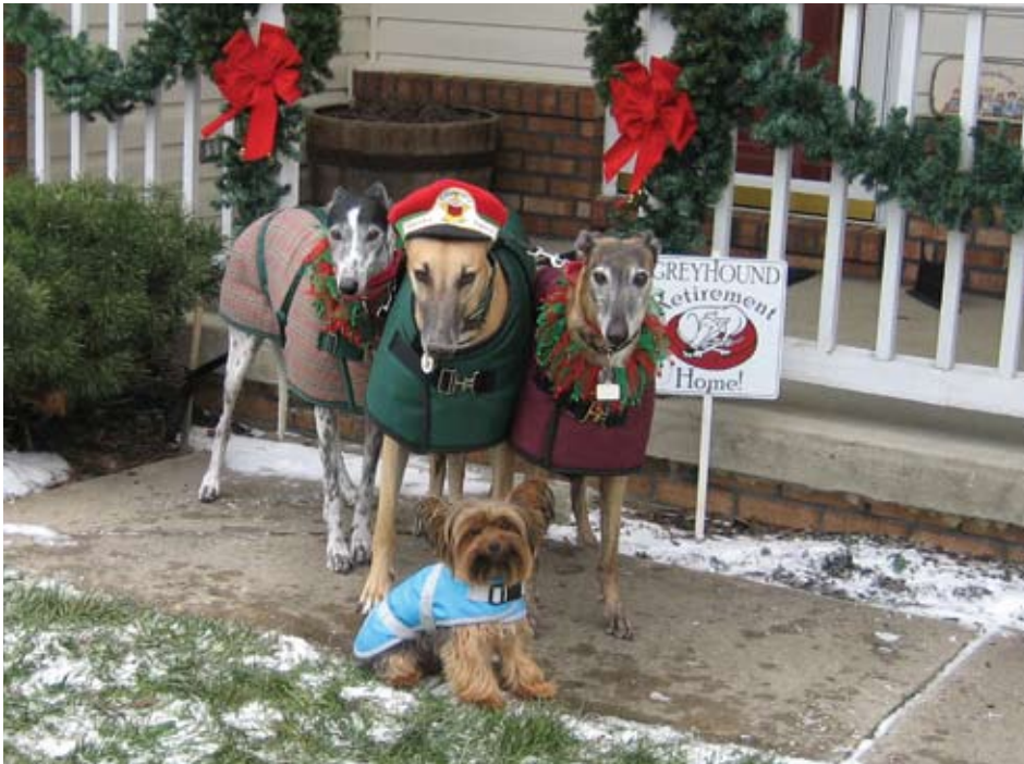
First Place Winner: Clara-belle (black & white), Liberty (fawn), Dreamie (brindle) and Johnny the Yorkie

Thanks to everyone who emailed or posted photos as part of our first photo contest. For all of the Greyt Holiday Photo contest entries, visit Yahoo! Groups GW Adopter site. Look in the photos folder, Newsletter January 2009 . Get out those cameras and watch your email for announcements about upcoming photo contests!