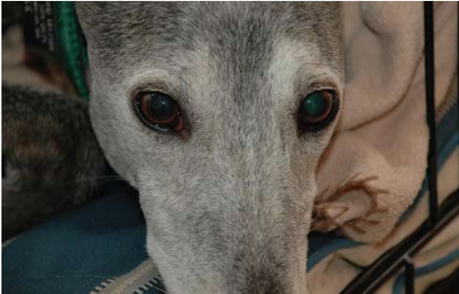
Bailey's story has much to teach us about love and selflessness.

At eight years old, a new chapter of Bailey's life began. Bailey embarked on this new phase of her life in October, but to really understand her story, it's necessary to go back to 2004, when she first entered retirement. You see, Bailey (then known as Tanya by GW) was placed in a forever home in Germantown, Maryland. As is typical among the GW volunteers, there was much rejoicing as another deserving hound found a comfy couch.