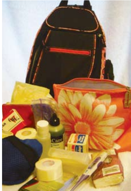
Keeping your First Aid Kit in a small backpack makes it easy to grab and go.

Some people may choose to create a small kit for their car, with larger kits at home. Think about