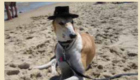
Contest Winners and Runners-Up, pgs 8-9

to learn to stop at her "mark" (a spot on the floor), to bark on command, and to put her head up or down, as well as all the other basic dog commands.