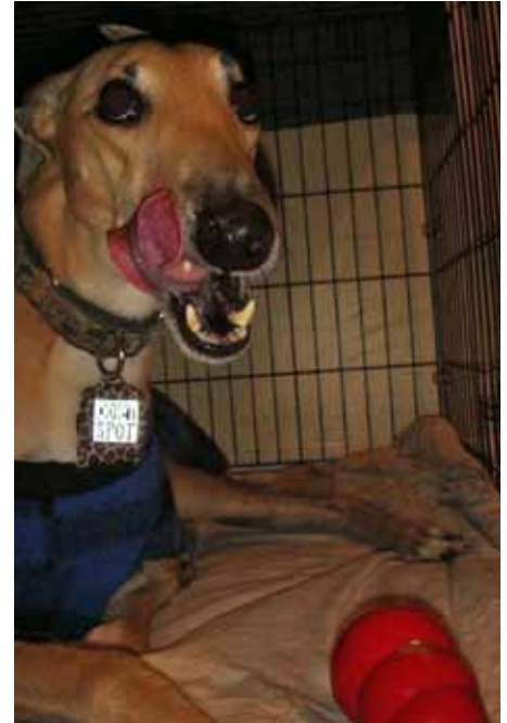
Giving your dog a treat in his crate can help distract him during the frightening sounds of fireworks.