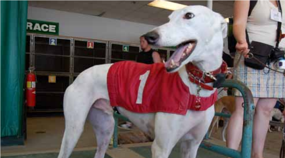
Turbo remembers the jenny pit drill and poses in a race blanket.