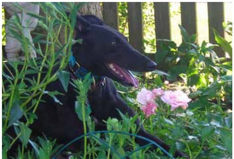
PJ's Zuni enjoys time outdoors.

For instructions on sending samples to NC State, visit www.cvm.ncsu.edu/vth/ticklab.html . Click on the link on the right side of the page entitled "Request Form with Instructions." Print that form and give it to your vet. ■