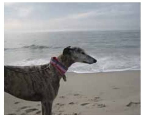
Third Place Winner: Breeze