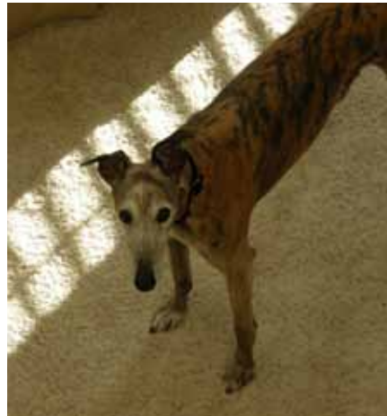
Journey asks what he's supposed to do outside of the crate.

When your hound is out of the crate, the choices for her are limitless, the physical boundaries are few, and so many enticing pleasures present themselves. The chair leg is ever present for gnawing, pooping in the upstairs bedroom provides immediate relief without fouling her dog