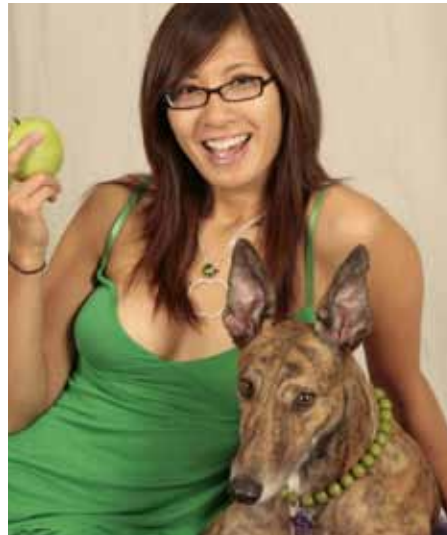
Roxy got an agent before Meiyee did.

a print ad for World Floor Covering Association. She's also auditioned for several dog food commercials and for the TV show "America's Top Dog."