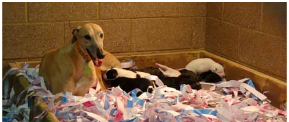
A mama dog cares for her week-old pups.