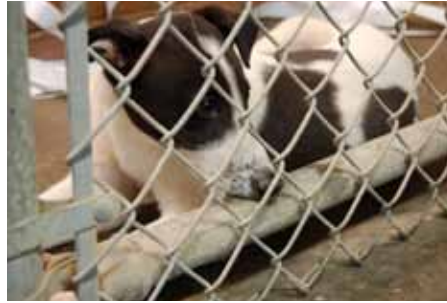
A greyhound puppy.

Saturday featured tours of the paddock area (also known as the jenny pit) where the day's race dogs are kept until they race, dressed for the races and led out. After the race, they are taken to the cooling room where they are cooled down and checked over by their trainers or handlers before returning to their kennels. During the afternoon tour, attendees were able to see dogs who had just run schooling races taken to the cooling room. Handlers rinsed the dogs' eyes with saline, cleaned their ears and hosed them down. The dogs were then given a check over for any minor injuries. There was live racing at the track both days at Raynham and many of the retired dogs were pulling their owners out to the track apron, trying to get their feet back on the track. The hounds got their wish when they were allowed to walk on the track during the Back on Track event, during which they also received a blessing from an ordained minister.