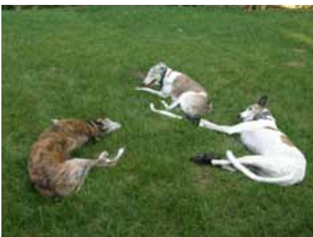
Journey, Topaz & Hampton