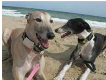
Butter & Molson