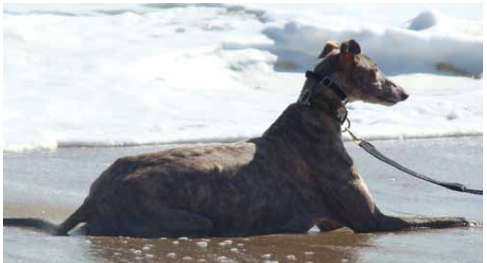
Trixie, adopted by Eliza, enjoys the surf.