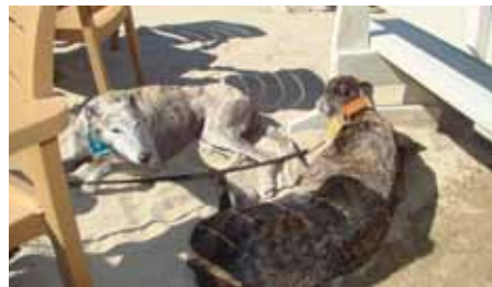
Breeze and Kiaba enjoy the sunshine.