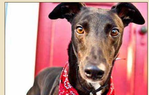
Contest Winners and Runners-Up, pgs 10-11