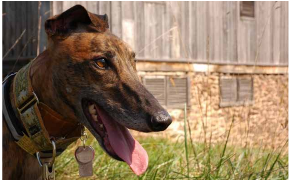
Abbey, Banshee Reeks Nature Preserve

For more experienced hikers, Manassas Battlefield offers two longer-ranging hikes with moderate elevation changes. The trails follow the major points for the first and second battles in the area. Shorter hikes through fields and woods are available starting from the visitors' center. Antietam Battlefield offers shorter and easier hikes while learning about the deadliest Civil War battle. Join up with a park ranger for the outdoor portion of the battlefield tour to gain a first-hand