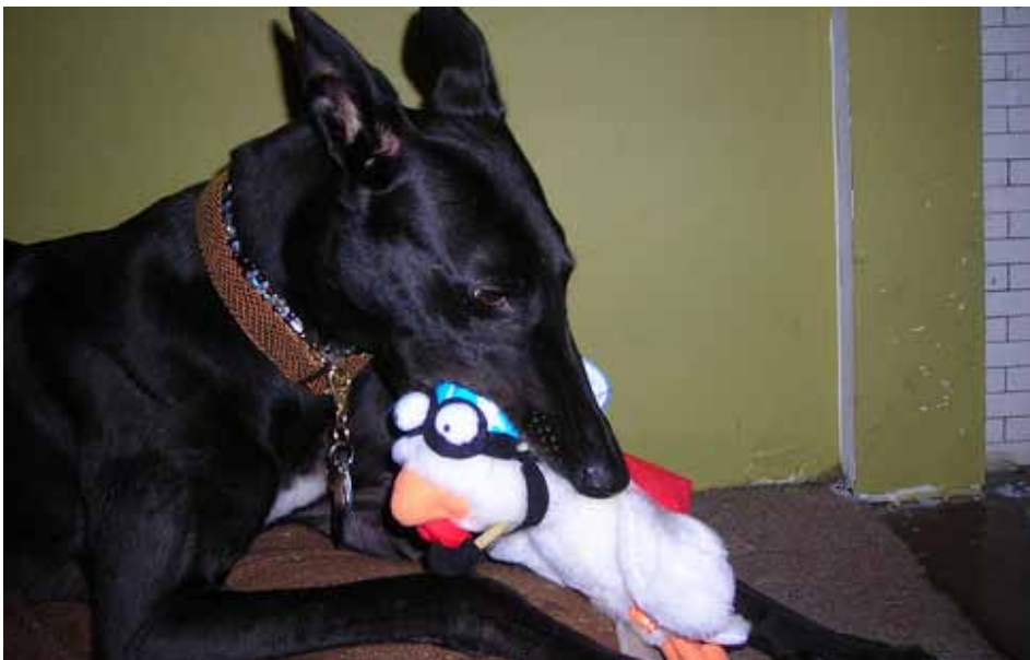
Second Place Winner: Zuni