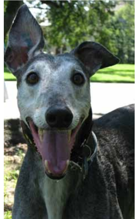
Third Place Winner: Xander