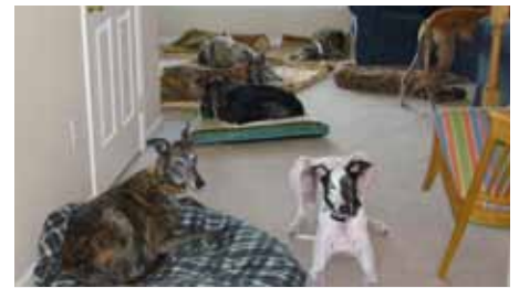
GW dogs enjoy being roomies.