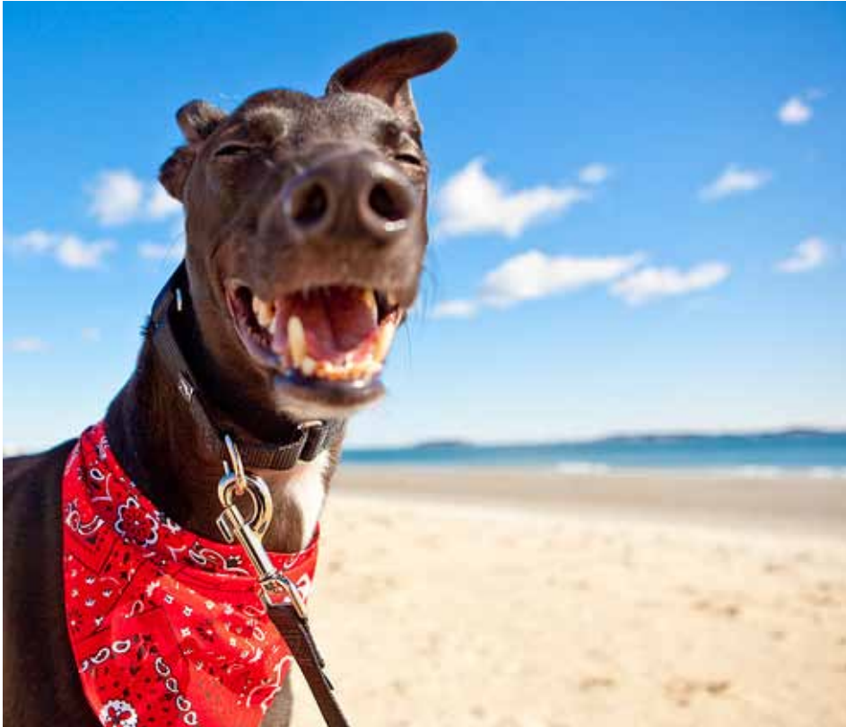
First Place Winner: Tobin

Thanks to everyone who emailed or posted photos as part of our photo contest. For all of the photo contest entries, visit Yahoo! Groups GW Adopter site. Look in the photos folder, Newsletter Fall 2009 . Get out those cameras and watch your email for announcements about upcoming photo contests!