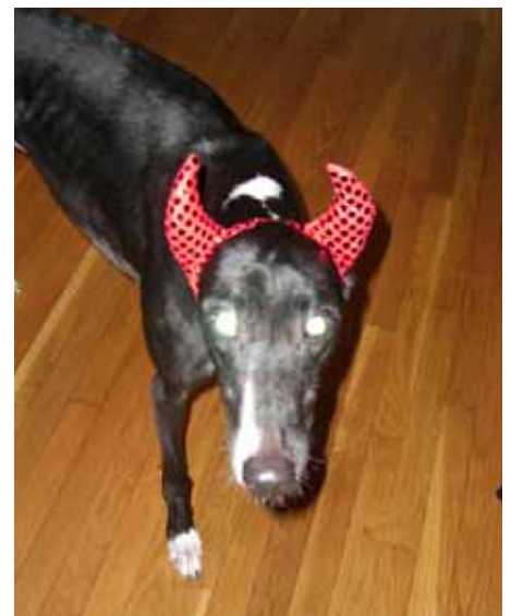
Honorable Mention: Inky