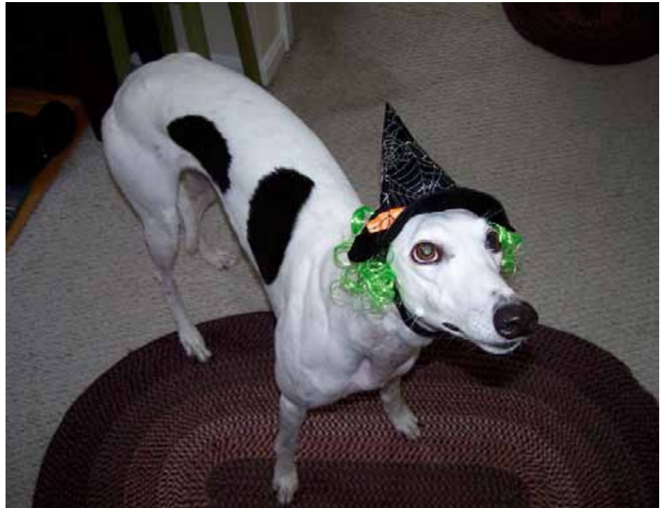
Ruby enjoys getting dressed up for Halloween

Some dogs enjoy getting dressed up in costumes. Other dogs can become scared or uncomfortable. If you want to dress your dog up, start simple and see how your dog handles it. If your dog does not like it, try a Halloween bandanna or collar. If your dog likes getting dressed up, choose a costume that fits comfortably. If it is too tight, it can cut off circulation or cause chaff-